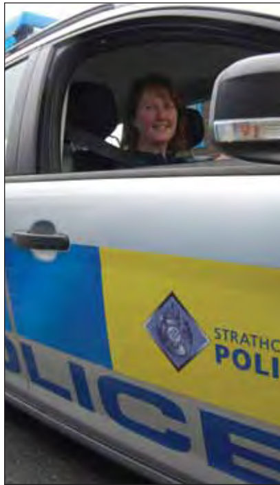
In the driving seat: multi-tasking comes naturally