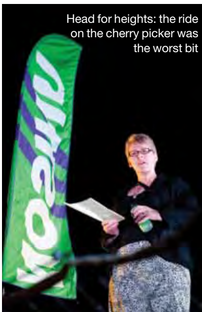
Head for heights: the ride on the cherry picker was the worst bit

'Figures show that a quarter of those waiting for social housing in Northampton have experienced domestic violence. I just wanted to make a difference.'